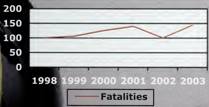
“Motorcycle Fatalities Increasing”